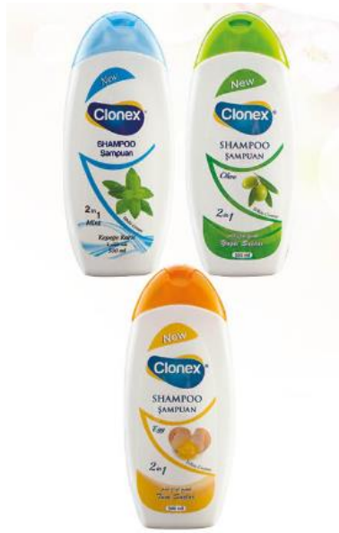
Clonex - Shampoo