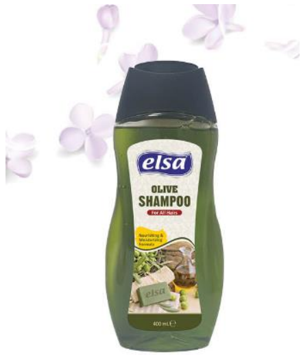
Elsa - Shampoo