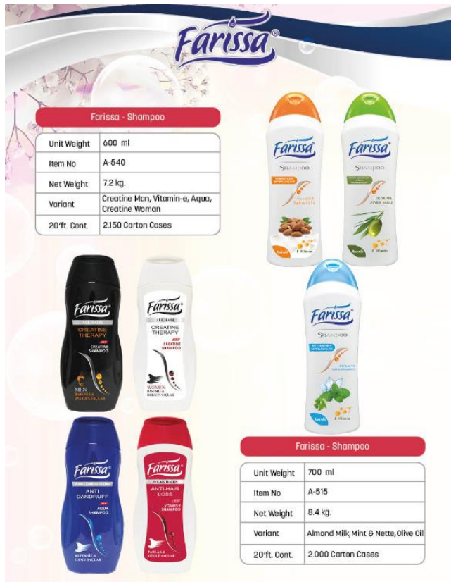
Farissa - Shampoo