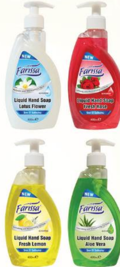
Farissa - Liquid Hand Soap