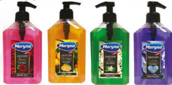
Maryna - Liquid Hand Soap